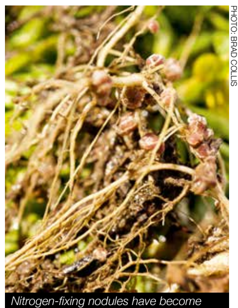
Nitrogen-fixing nodules have become a vital resource for improving the productivity of Australian soils.

From very early times, legumes have been recognised as 'soil improvers'. The farmers