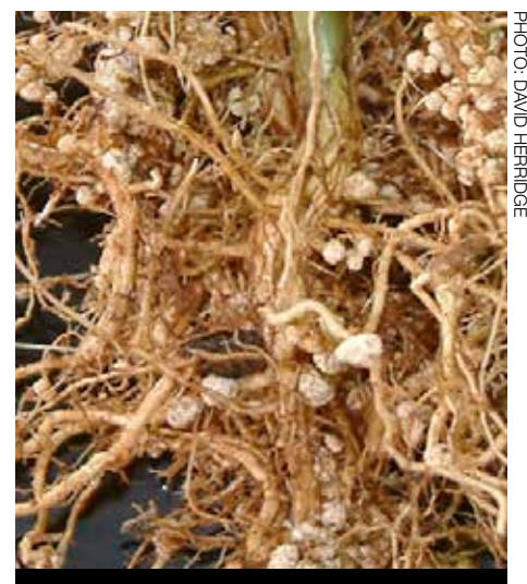
Soybean plant with nitrogen-fixing root nodules clearly visible.