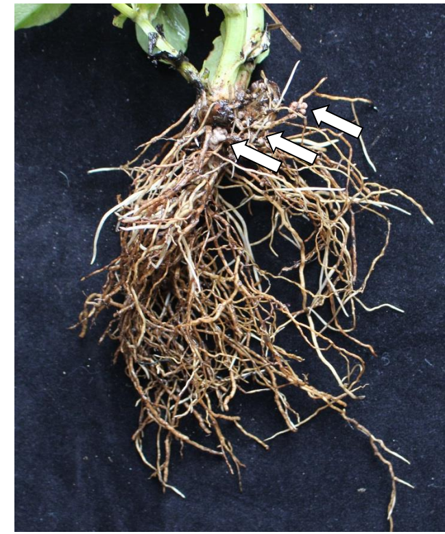
less than 15 nodules