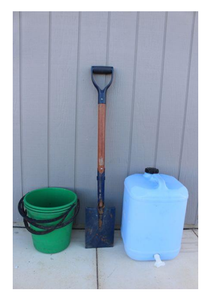
Buckets, spade, water