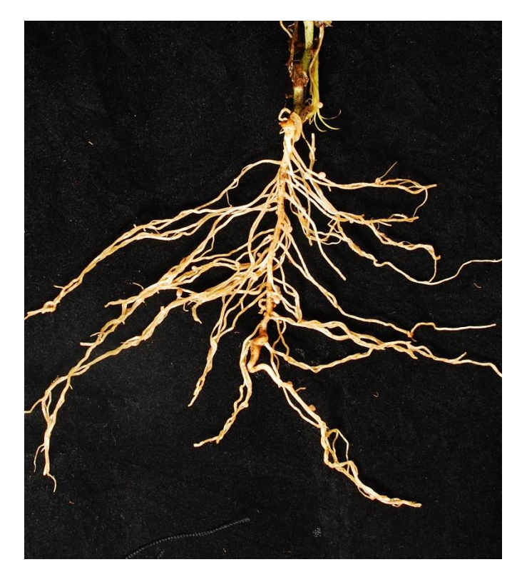
less than 20 nodules (red-brown earth)