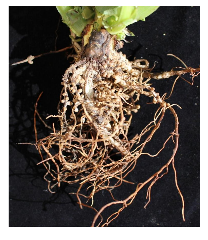
50 to 100 nodules per plant (20 nodules per plant on lighter soils)