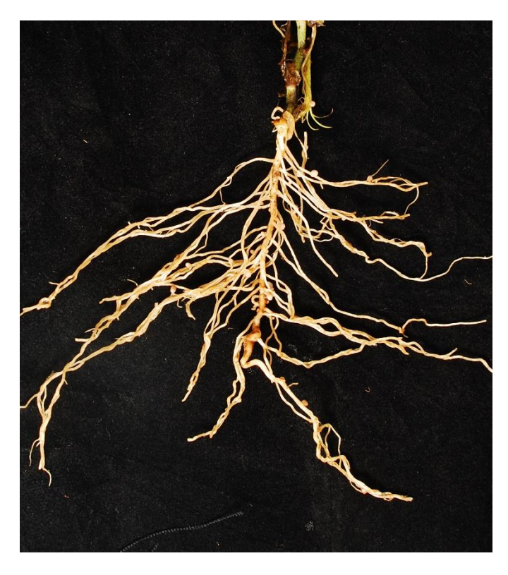
less than 20 nodules (red-brown earth)